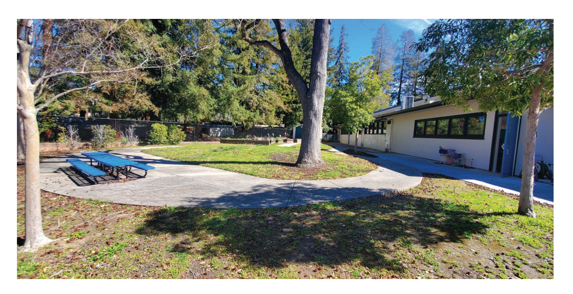
LANDELS ELEMENTARY SCHOOL