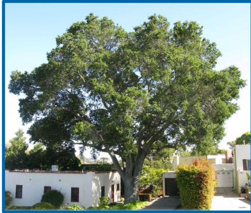
Coast Live Oak