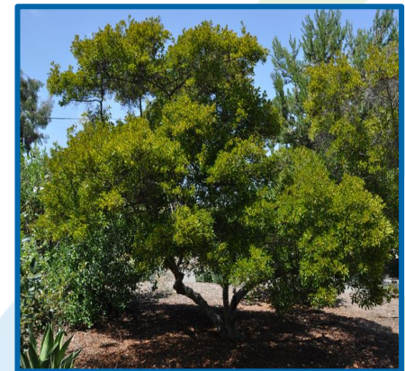
Pacific Wax Myrtle