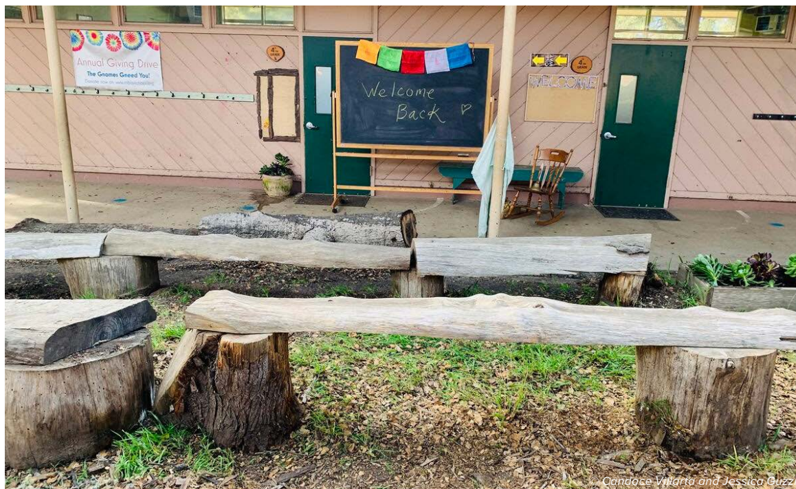
Seating made from repurposed logs and stumps are ready for school to begin at Monterey Bay Charter in Pacific Grove, California.

Share your good work! We would love to see and hear about your success with outdoor learning. Use this link to share photos and information about your outdoor spaces when they are up and running.