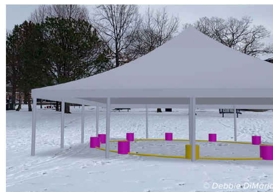
The Augmented Reality Tool was used to visualize a tent and seating arrangement in a snowy schoolyard in Chicago, Illinois.