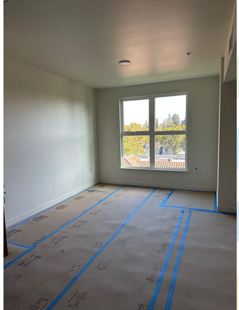
Mountain View Whisman School District