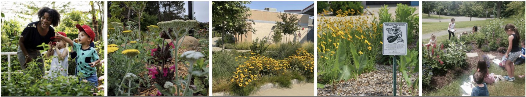
NATIVE POLLINATOR AND HABITAT GARDENS