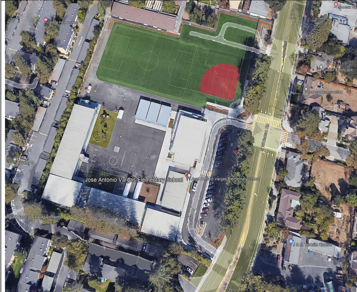
Jose Antonio Vargas Elementary School 220 N. Whisman Rd., Mountain View, CA 94043