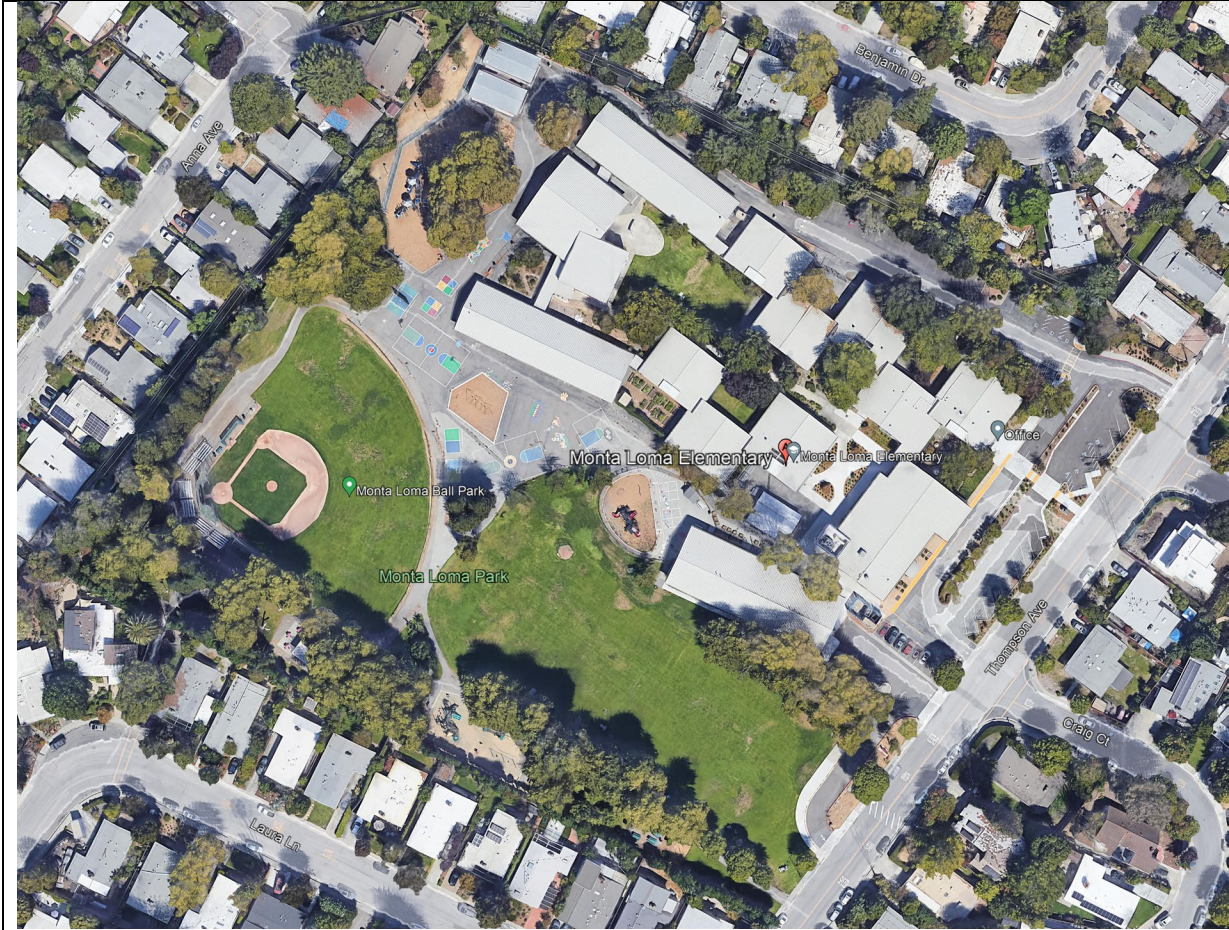
Monta Loma Elementary School 460 Thompson Ave., Mountain View, CA 94043