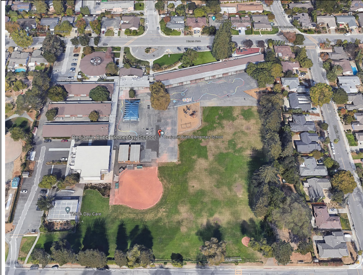
Benjamin Bubb Elementary School 525 Hans Ave, Mountain View, CA 94040