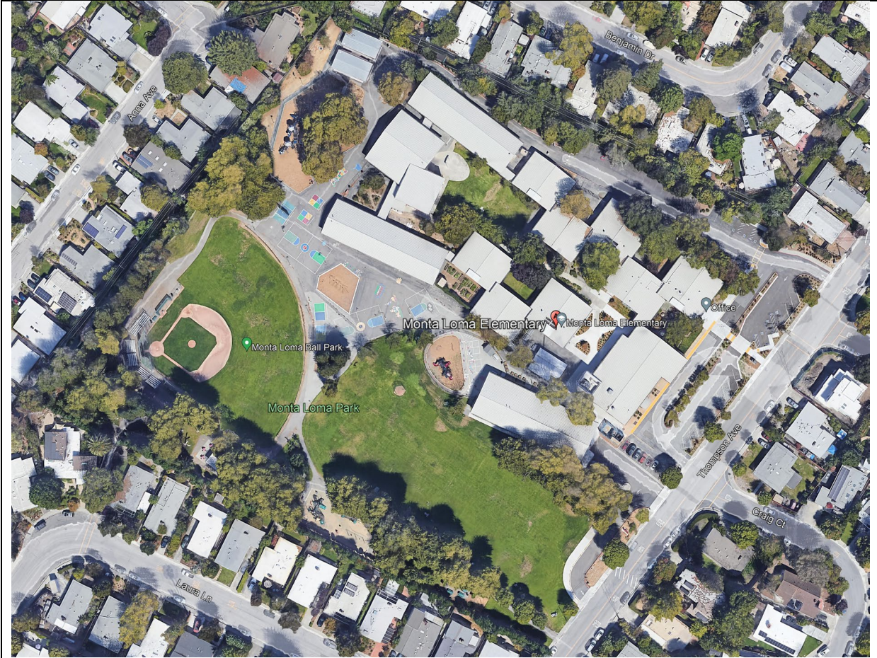
Monta Loma Elementary School 460 Thompson Ave., Mountain View, CA 94043