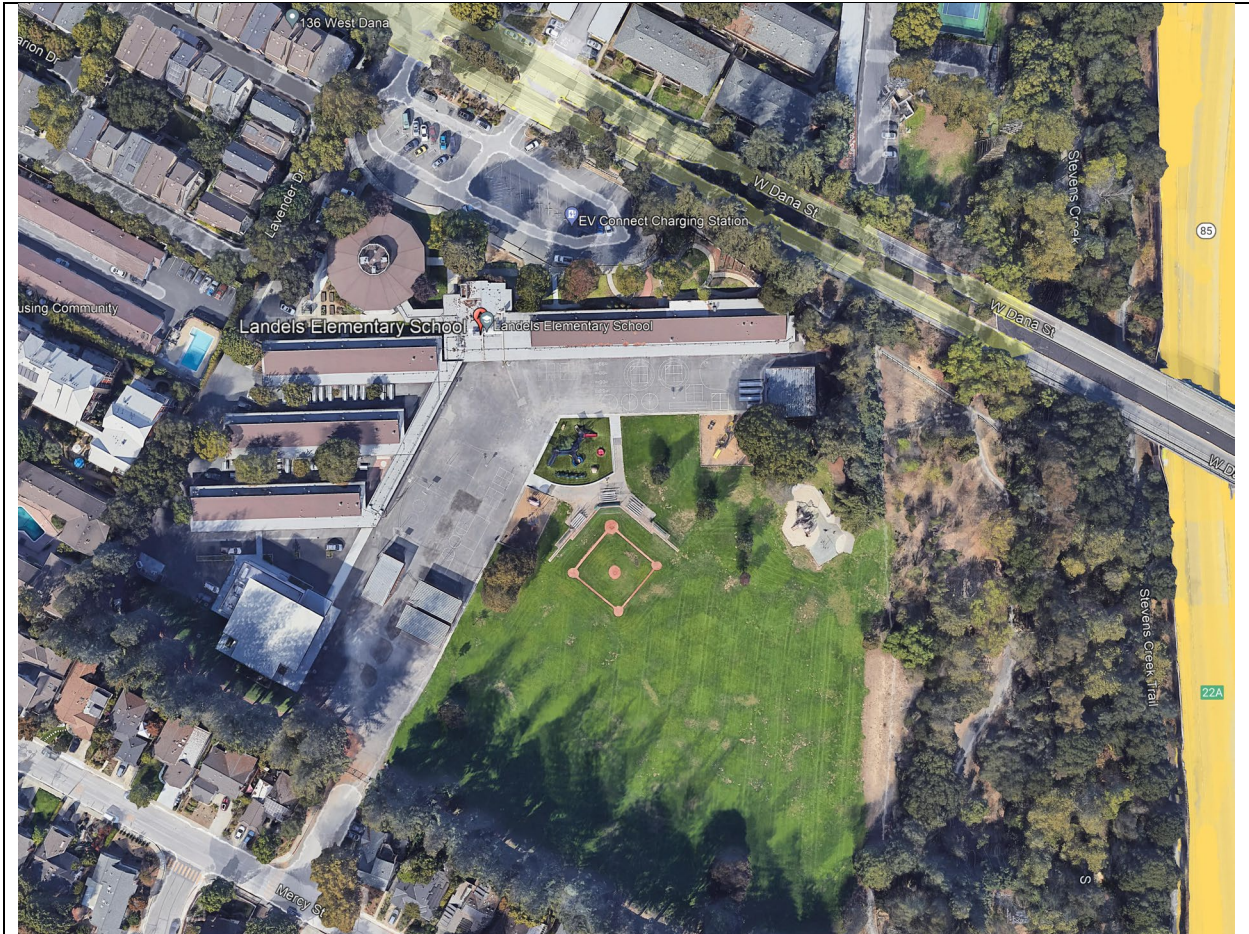
Edith Landels Elementary School 115 West Dana St., Mountain View, CA 94041