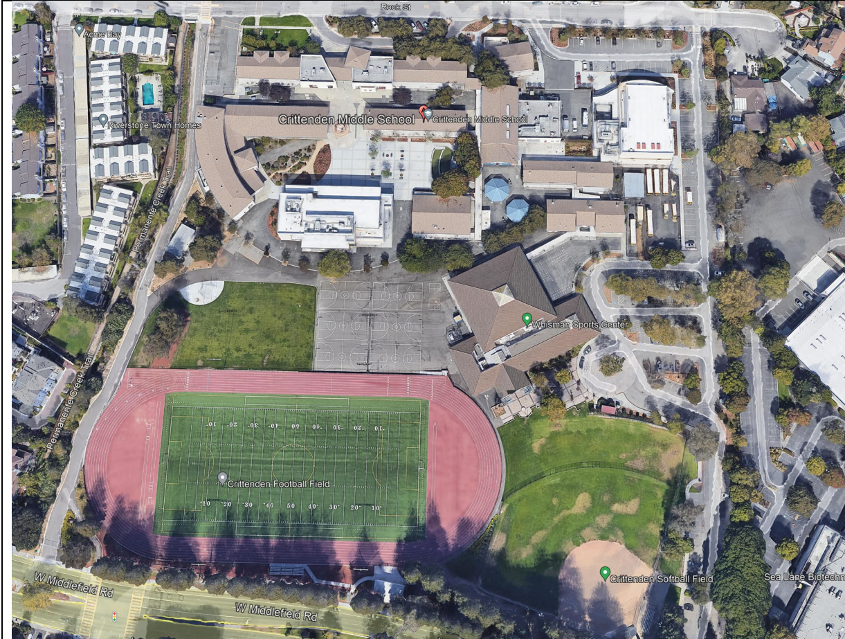
Crittenden Middle School 1701 Rock St., Mountain View, CA 94043