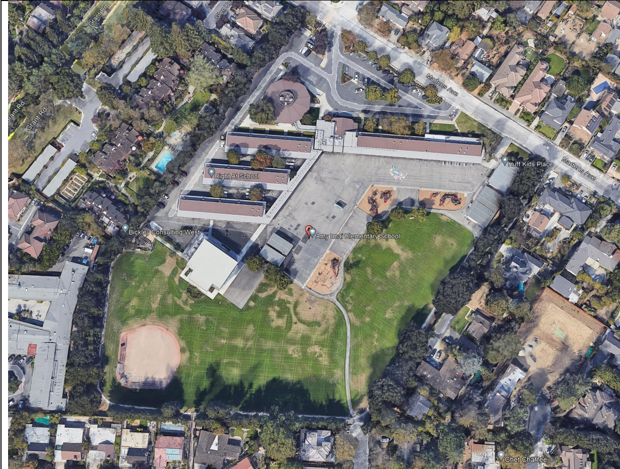
Amy Imai Elementary School 253 Martens Ave., Mountain View, CA 94040