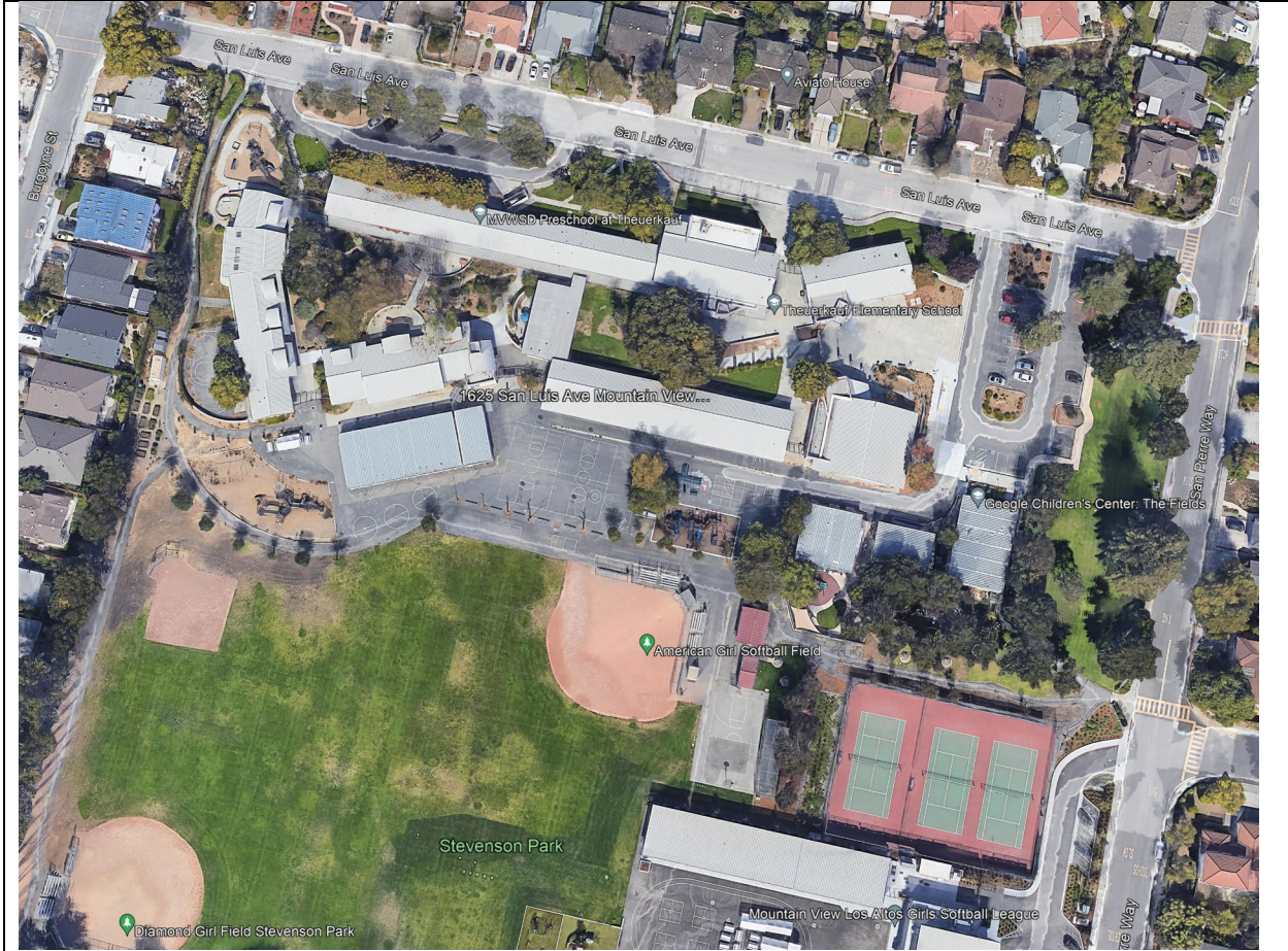
Theuerkauf Elementary School 1625 San Luis Ave., Mountain View, CA 94043