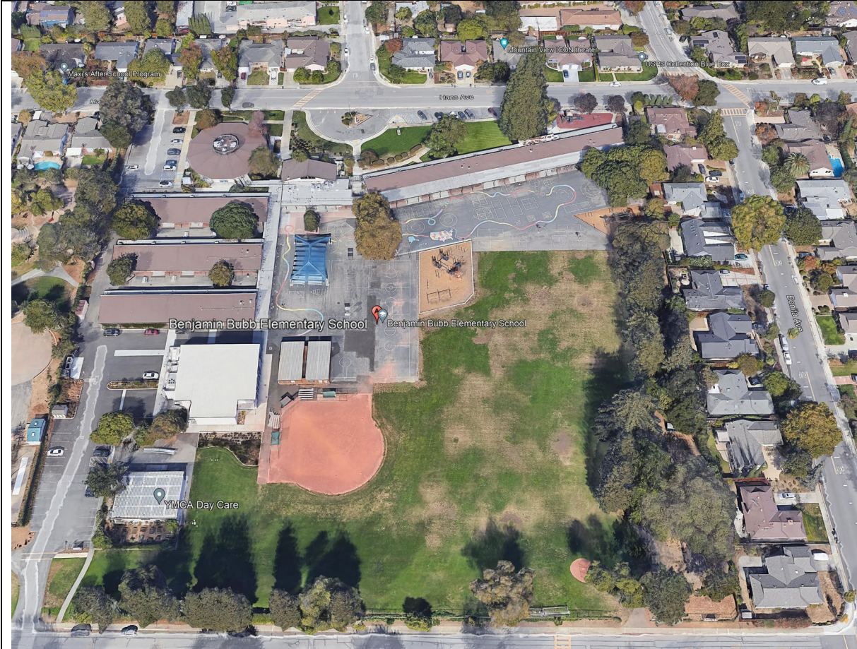
Benjamin Bubb Elementary School 525 Hans Ave, Mountain View, CA 94040