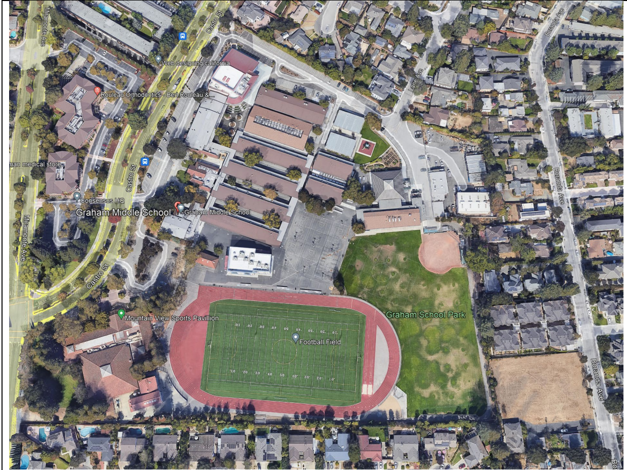
Graham Middle School 1175 Castro St., Mountain View, CA 94040