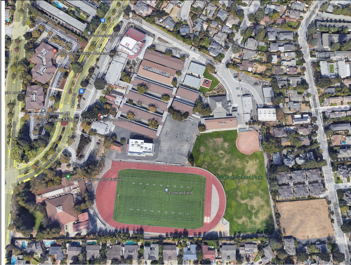
Graham Middle School 1175 Castro St., Mountain View, CA 94040