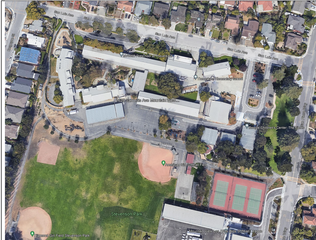
Theuerkauf Elementary School 1625 San Luis Ave., Mountain View, CA 94043