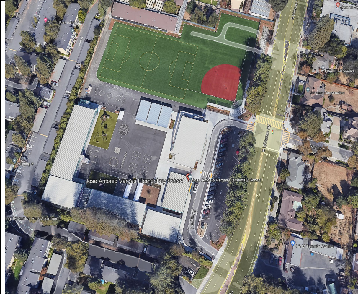
Jose Antonio Vargas Elementary School 220 N. Whisman Rd., Mountain View, CA 94043