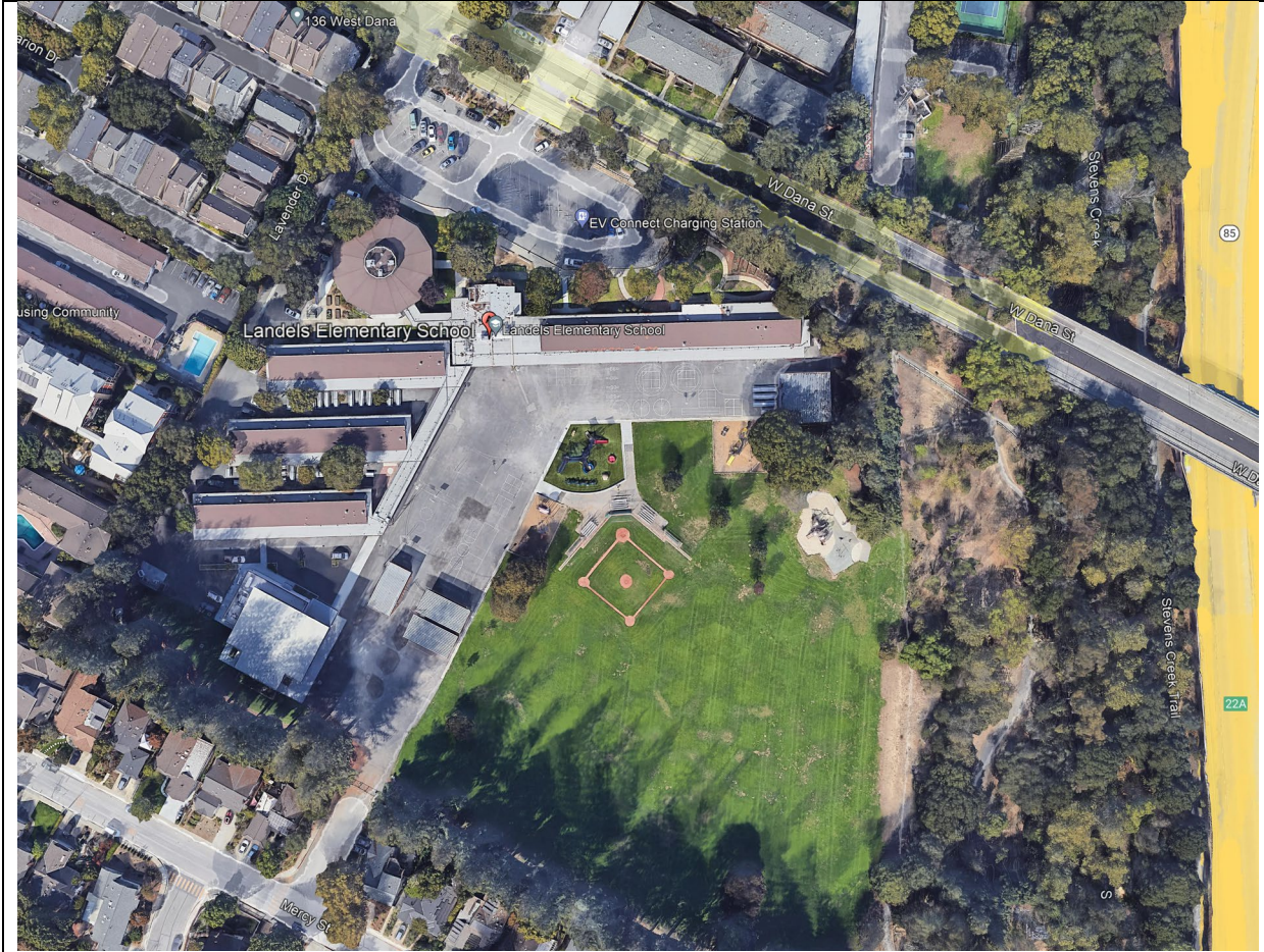
Edith Landels Elementary School 115 West Dana St., Mountain View, CA 94041