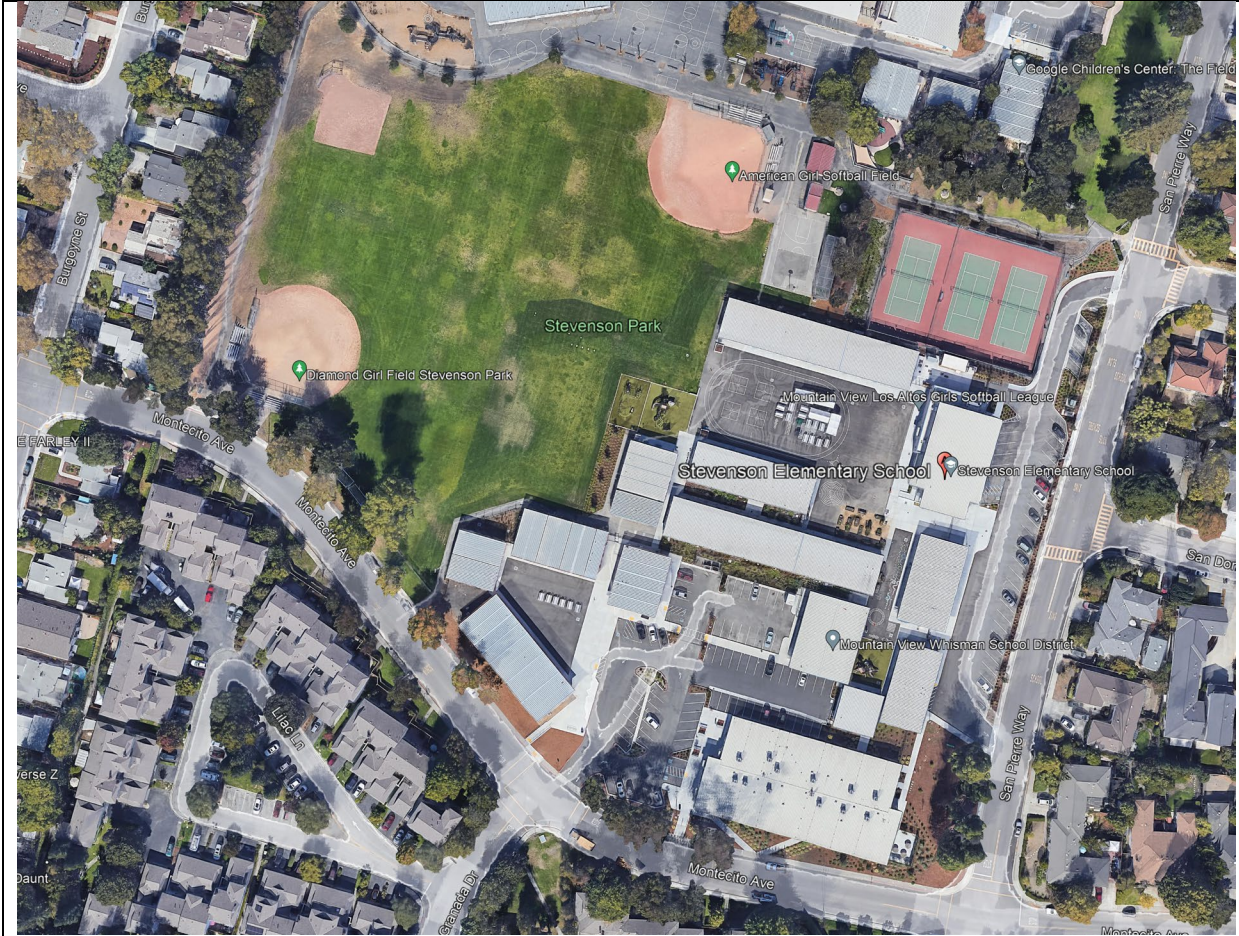
Stevenson Elementary School 750 San Pierre Way, Mountain View, CA 94043