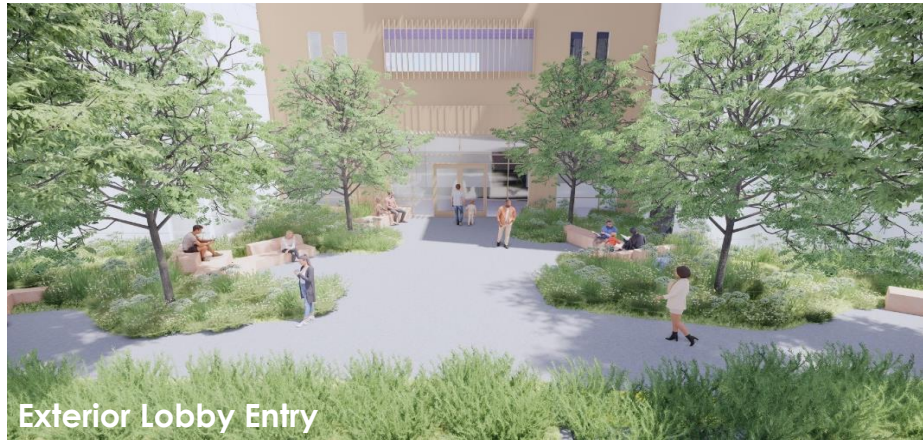
Exterior Lobby Entry