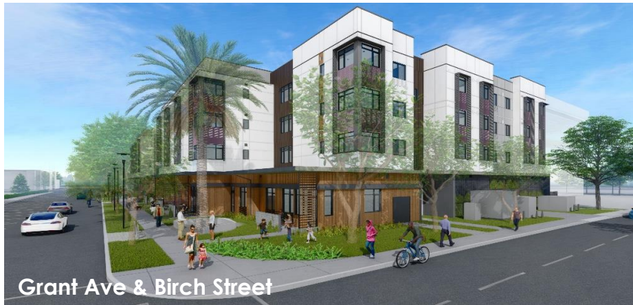
Grant Ave & Birch Street