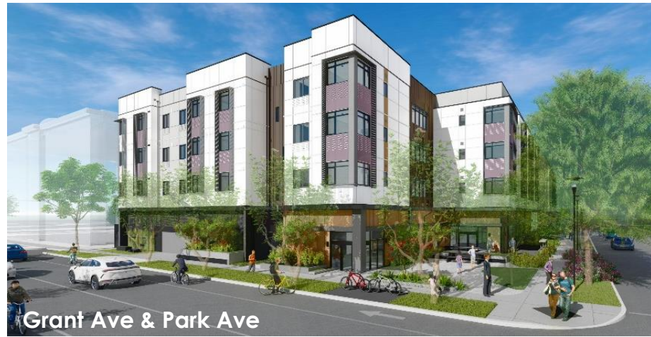
Grant Ave & Park Ave