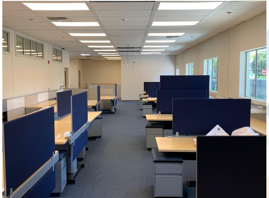
Mountain View Whisman School District