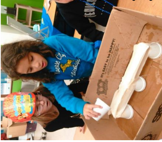
Pics for Kids