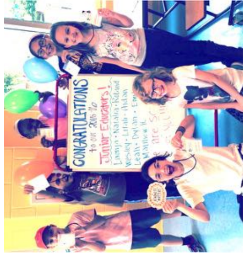
Student Leadership Program