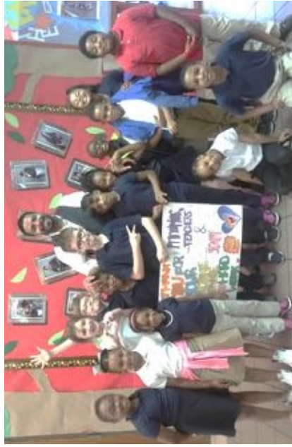
District Staff Appreciation